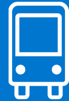
Route 15Ltd East Colfax Limited Effective: 4 January 2026 Map Revised: 4 January 2026