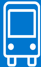
Route 100 Kipling Street Effective: 7 January 2024 Map Revised: 7 January 2024